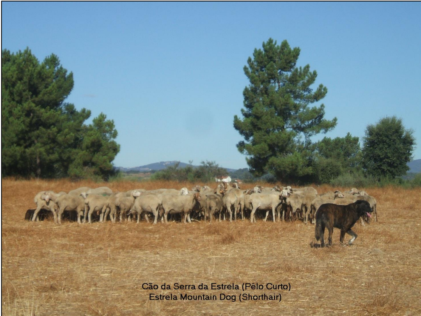
Cão da Serra da Estrela (Pêlo Curto) Estrela Mountain Dog (Shorthair)

The world changes by the minute in the wrong direction, at least for me, in the matter that brings us here today, - and I believe I can speak for the CPC too, - and it may compromise the noble existence of the canine breeds. And how can we reverse this reality? How can we capture a potential dog owner for this problem? How can we guarantee a relevant place for the dog in this apocalyptic and destructive society which is acting in the name of a cynicism never seen before?