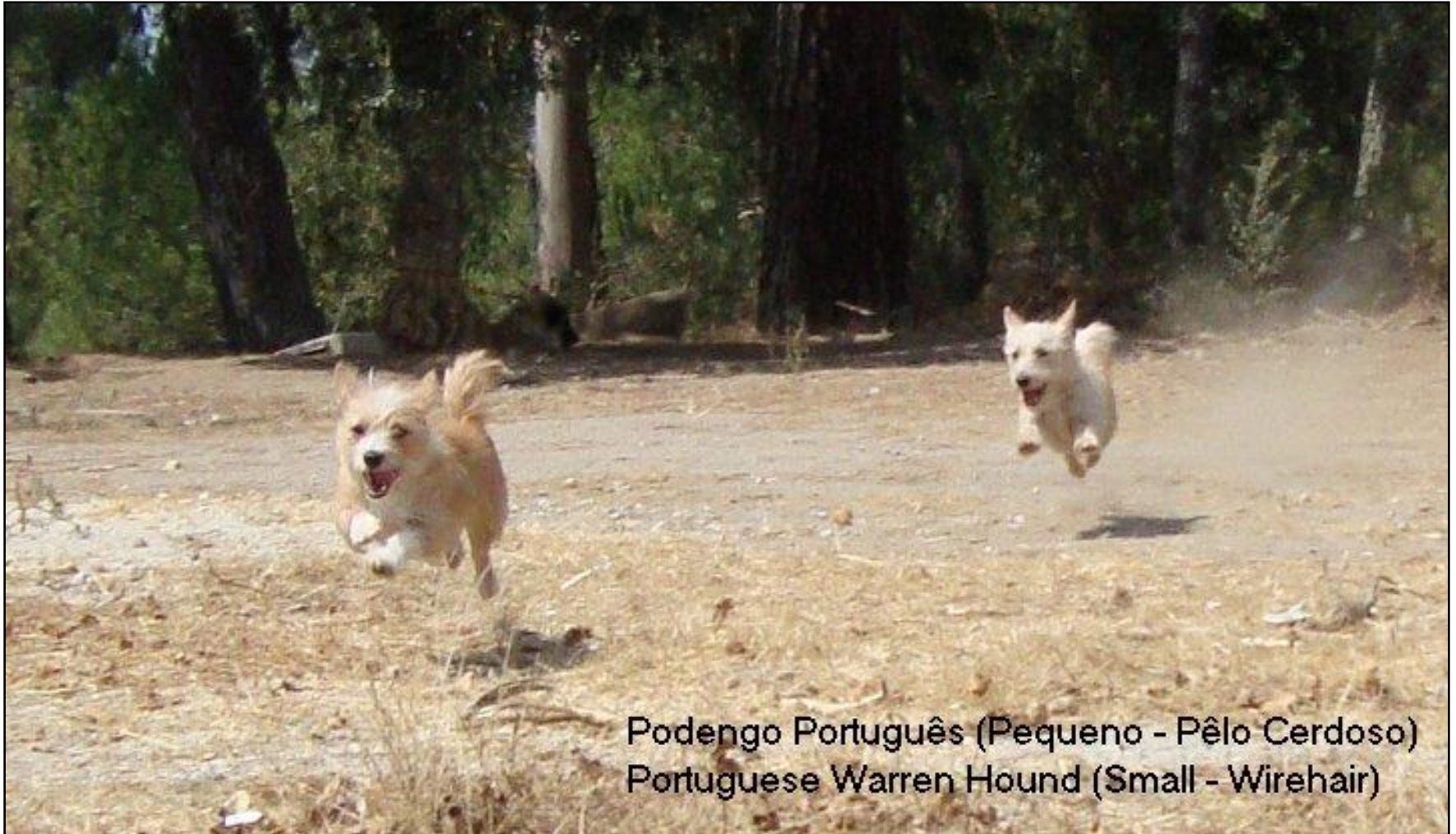
Podengo Português (Pequeno - Pêlo Cerdoso) Portuguese Warren Hound (Small - Wirehair)