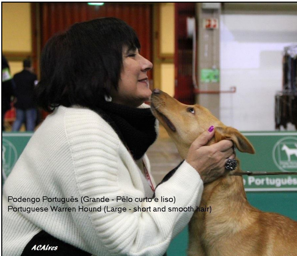
Podengo Português (Grande - Pêlo curto e liso) Portuguese Warren Hound (Large - short and smooth hair)