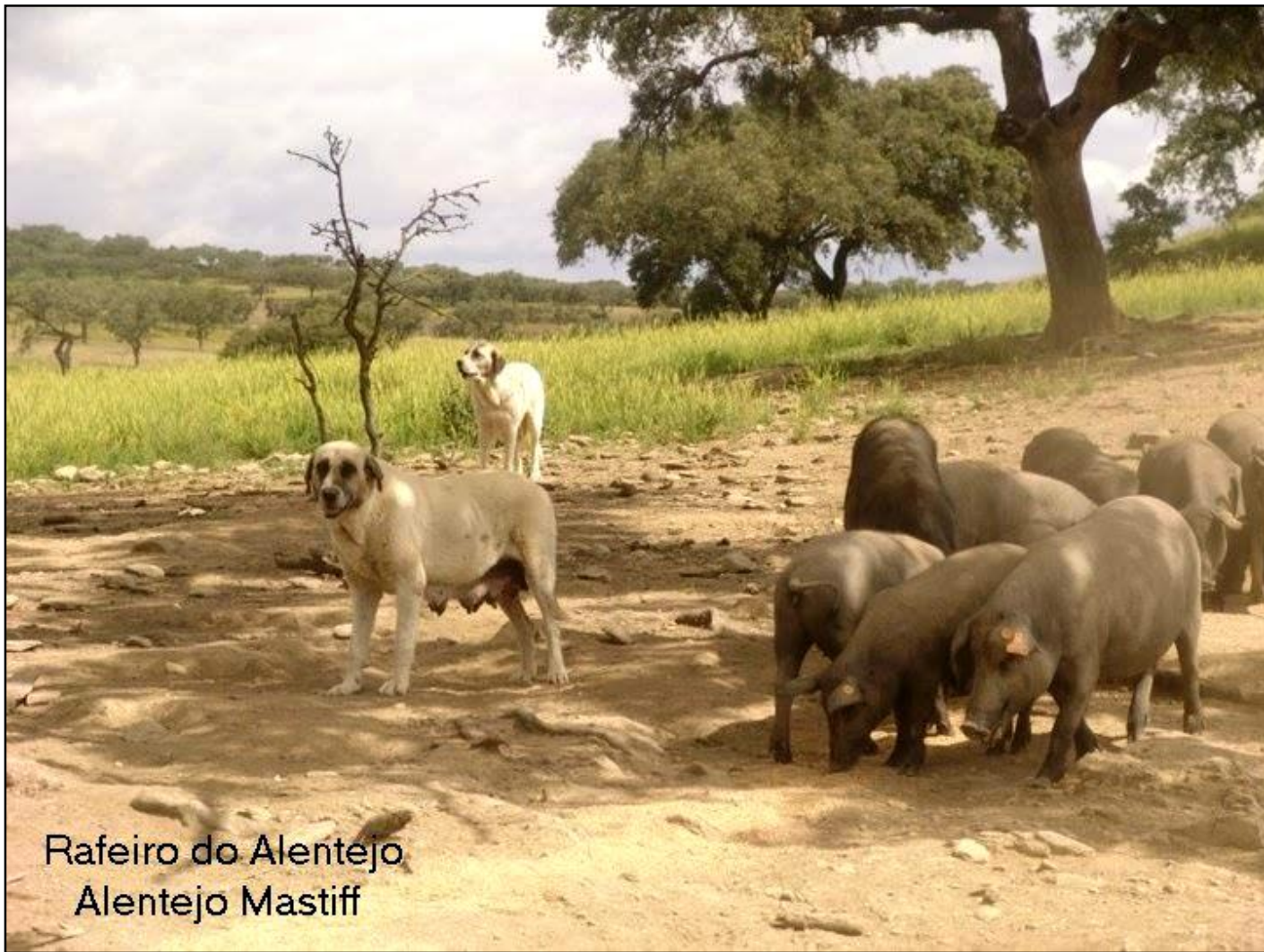
Rafeiro do Alentejo Alentejo Mastiff