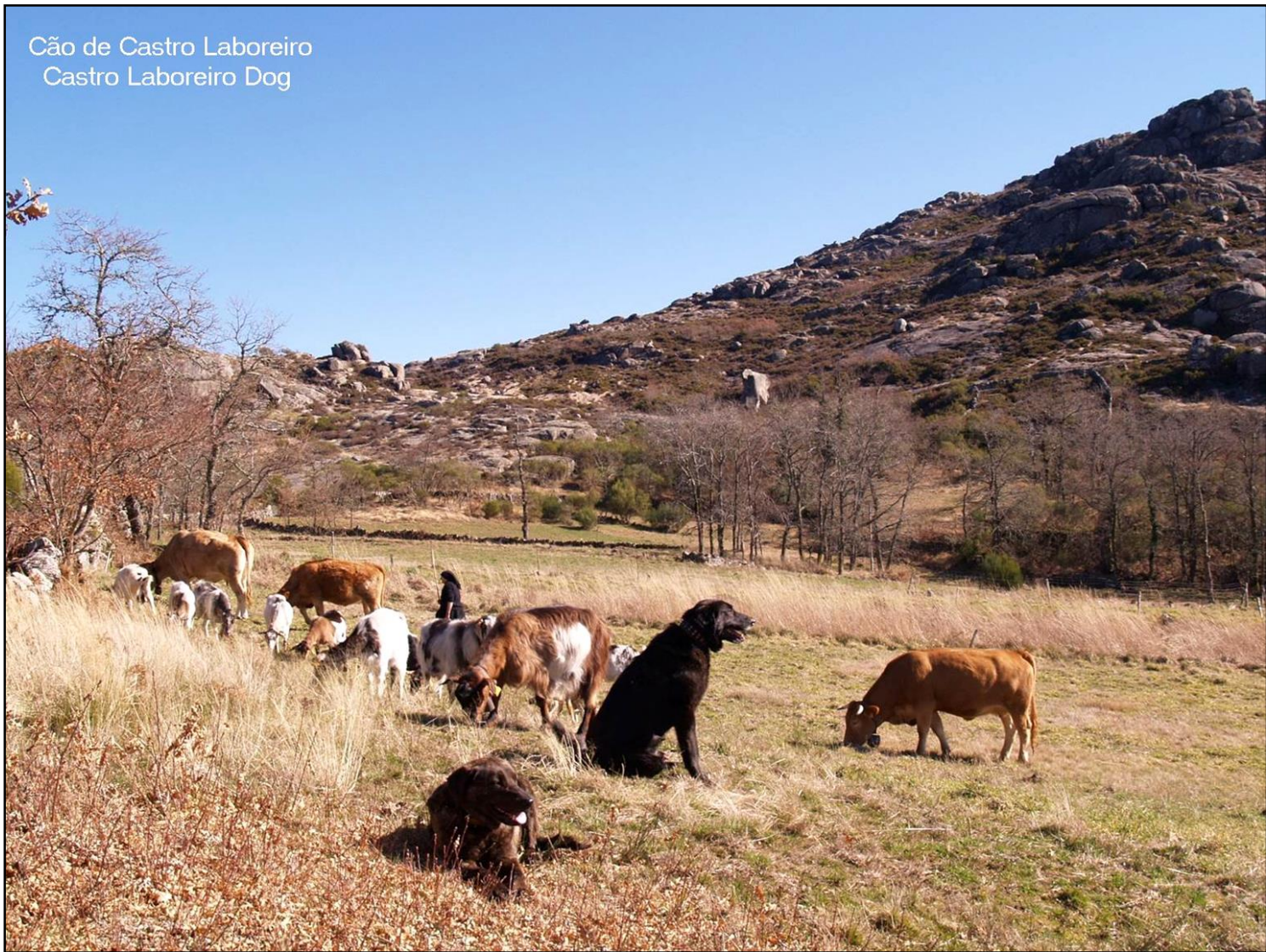
Cão de Castro Laboreiro Castro Laboreiro Dog

There are more and more "associations" for the protection of the abandoned, whose purpose is not as meritorious as it is propagandized and there has been a certain impotence on the part of some Kennel Clubs in different countries, to make themselves heard and respected.